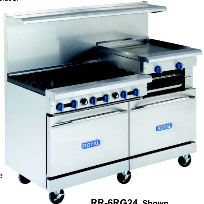
RR-6RG24 Shown With Optional Casters