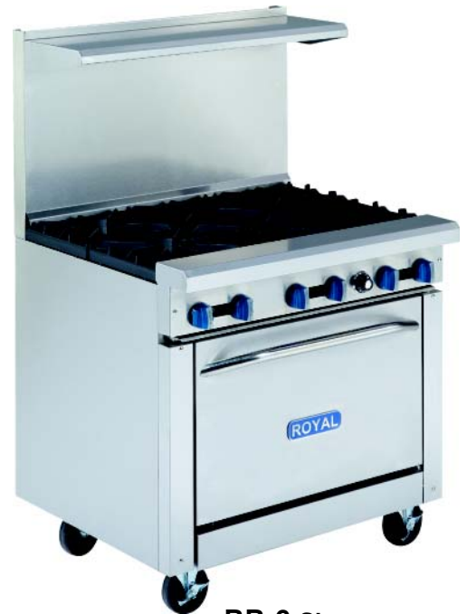
RR-6 Shown with optional casters

Royal Restaurant ranges have been designed to give the most useful features at an affordable cost. All stainless steel sides, and front panels, including the oven doors and kick plate are easily cleaned and rugged enough to withstand the constant heavy usage of a busy kitchen. Oven interiors are porcelain coated on all contact surfaces for fast and easy cleanup. The ovens are thermostatically controlled with 100% safety on the pilots to shut off the oven gas flow if the flame should go out. There is a push button ignitor for easy lighting of the oven pilot. 12" x 12" heavy cast iron grates (18" x 24" on RR-4-36) cover the unique two piece lift off burners, rated at 30,000 BTU/hr. each.