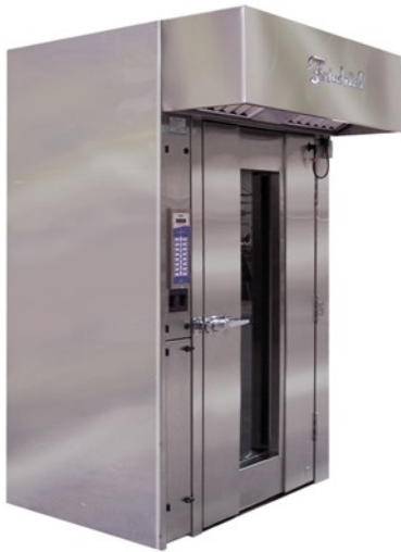
Shown: Model FMP904 Single Rack Oven Holds 10-20 pans of product

Bake or Roast or Retherm in this versatile rack oven while operating in the 'green'. Special attention has been given to energy conservation, lower maintenance costs, and more standard features for a better value.