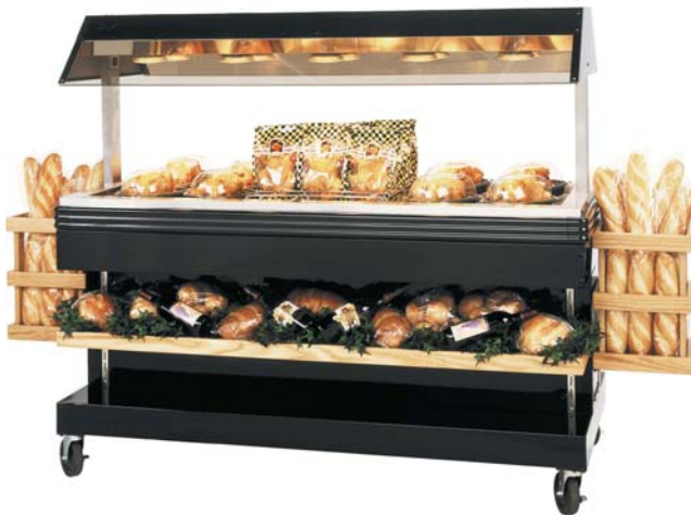
BKI's Hot Deli Display Island (MM-6) shown above with optional bread rack shelf and bread box ends