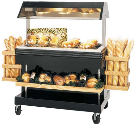
BKI's Hot Deli Display Island (MM-4) shown above with optional bread rack shelf and bread box ends