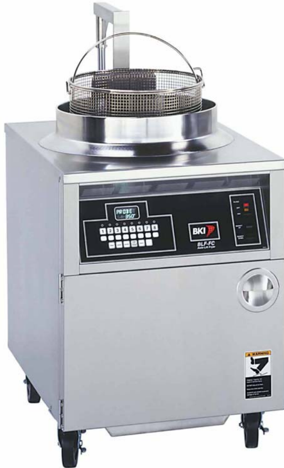
BKI's BLF-FC Electric Auto-Lift Fryer shown above