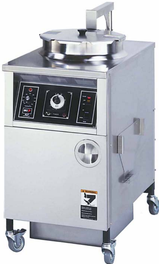
BKI's ALF-F Electric Auto-Lift Fryer shown above with optional Lid Cover and Hanger assembly