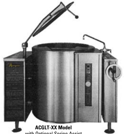
ACGLT-XX Model with Optional Spring Assist Cover and faucet