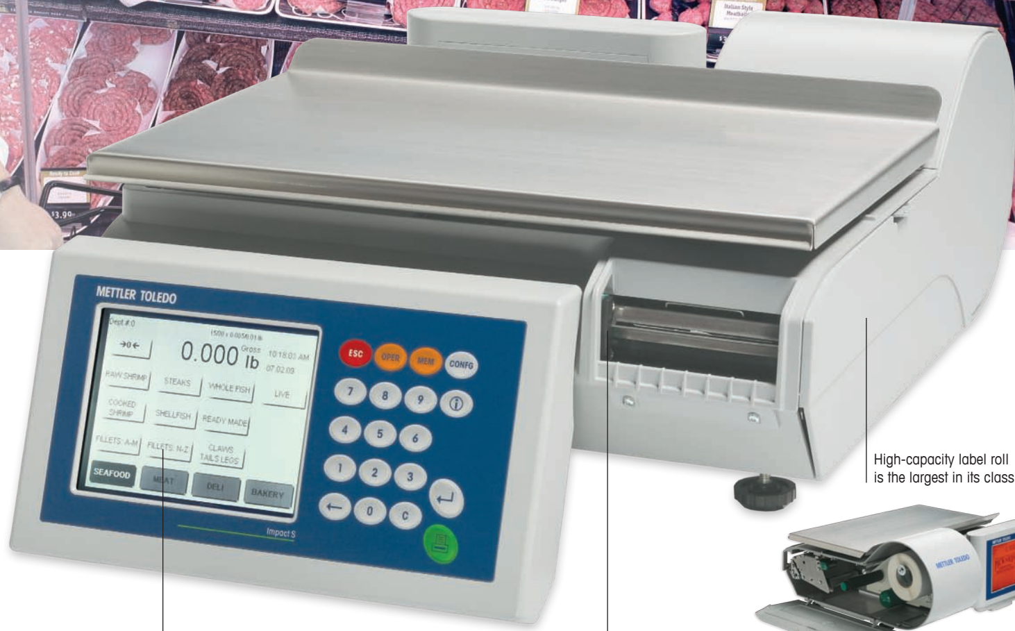
Combination touchscreen and tactile keyboard is easy to use with easy to follow menus.