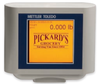
Large customer display shows branding messages, logos and promotions.