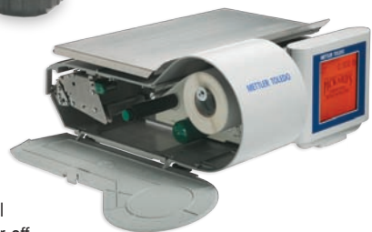
High-capacity label roll is the largest in its class.